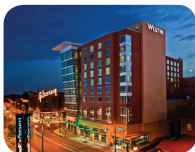
Westin Memphis Beale Street Memphis, TN